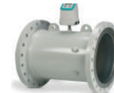
SIEMENS SITRANS FUS380 ULTRASONIC FLOW METER