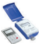
HEXING Z-LINK PREPAID WATER METER