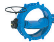
DOUBLE ECCENTRIC BUTTERFLY VALVE