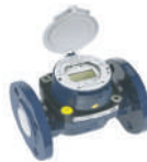
SENSUS MEISTREAM PLUS METER