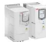
ABB HVACR DRIVES