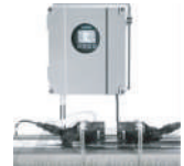
CLAMP-ON FLOW METER