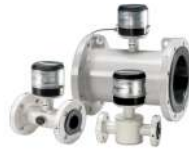
SIEMENS MAG 800 BATTERY OPERATED