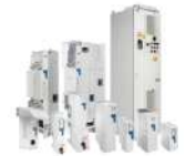
ABB ACQ 580 VARIABLE SPEED DRIVE (Pumping)