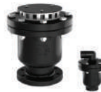
PLASTIC AIR VALVE