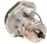
ADVANCED PILOT VALVE