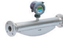
SIEMENS CORIOLIS METER