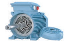
IES SYNRM MOTOR