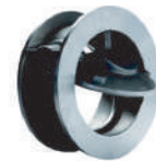
CHECK VALVE TILTING DISC