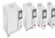
ABB ACS 480 VARIABLE SPEED DRIVE (MULTIPURPOSE)