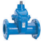
RESILIENT SEAL GATE VALVES (RSV) – FLANGED