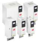
ABB ACS 380 VARIABLE SPEED DRIVE (Machinery)