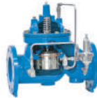
PRESSURE SUSTAINING VALVE