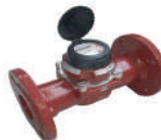
SENSUS WPD FS HOT WATER METERS 130°C