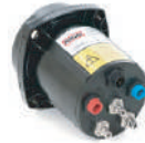
3P2F CONTROL LOGGER