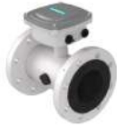
SIEMENS MAINS POWERED MAGS