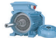
TRADITIONAL INDUCTION MOTOR