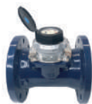
SENSUS WPD METER