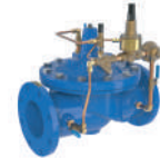
PRESSURE REDUCING AND PRESSURE SUSTAINING VALVE