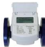
SENSUS CORDONEL ULTRASONIC METER INCL SENSUS RF RADIO