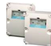
MULTIRANGER / HYDRORANGER 100 / 200