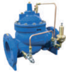
PRESSURE REDUCING CONTROL VALVE